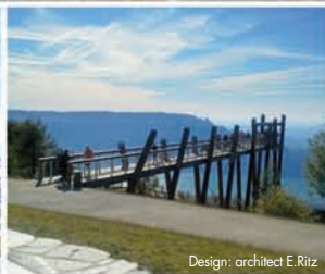
Design: architect E.Ritz